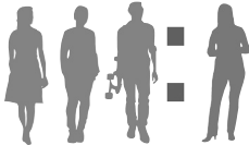
3:1 student-faculty ratio

323 professorial faculty 558 postdoctoral scholars